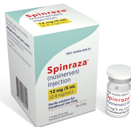
Not shown actual size

STORAGE REQUIREMENTS: Store in a refrigerator between 2°C to 8°C (36°F to 46°F) in the original carton to protect from light. Do not freeze. See product packaging and Prescribing Information for complete list of instructions. 1